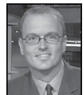
Scott Van Pelt